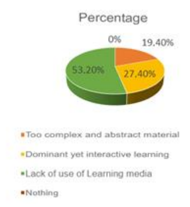
Figure 1. Circle Diagram of the Results of Difficulty Analysis of Biological Material for Plant Growth and Development

Figure 1 shows the analysis of students' difficulties in understanding biology material on the concept of plant growth and development, there are several reasons among them, 53.20% of students answered that biology material was difficult to understand due to lack of use of learning media, 27.40% of students answered that biology material was less interactive, 19.40% of students answered that biology material was too complex and abstract.